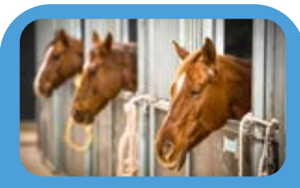
'Behind the Scenes at Godolphin' - 5<sup>th</sup> June