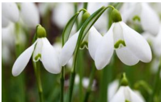
Microsoft Stock Images